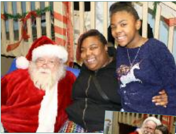
Santa took time out of his busy holiday schedule to visit with our Teresa Shelter and Maria House families. His bag was full of gifts for the children and moms thanks to our generous community.