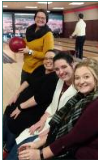
Program staff enjoyed lunch and a bowling outing courtesy of Cottingham & Butler and their carrier partner Anthem Stop & Loss.