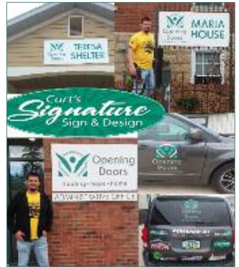
Our new logo was unveiled at "Attitude of Gratitude" on November 23, followed by new signage installed at our locations and on the van the following week.