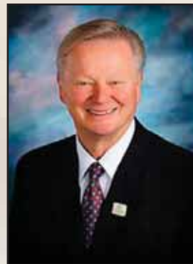
Mayor Roy Buol